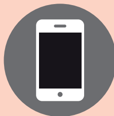
A tablet or smartphone