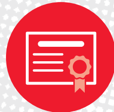
Enrol in a course