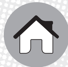
Nine months' rent